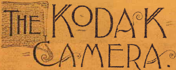
Front cover, one fourth of an 1888 brochure from Eastman Dry Plate and Film Co.

The Columbia Gorge Camera Club is holding it's 10th annual Gresham Camera Swap Meet on Saturday, May 21st from 9:00 a.m. to 4:00 p.m. It will be located at the Gresham Grange..875 NE Division St. in Gresham, Oregon which is just east of Portland off of I-84 at the 238th Drive Exit. Admission is $4.00 with a $10.00 early bird at 7:30 a.m. Tables are $35.00. This has been a very friendly, but small, show in the past but would be a wonderful excuse for a trip into the scenic Columbia River Gorge. For all the information call Krystal (503) 239-8912.